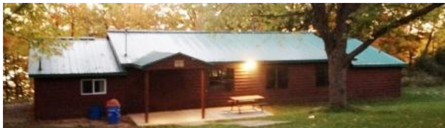
AUTUMN 2012 DOUG MACKENZIE HALL