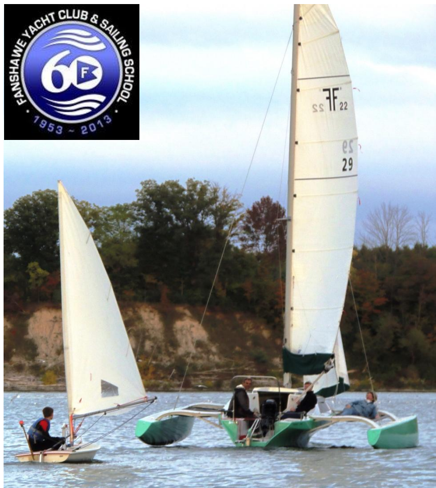
THE LARGE AND SMALL AT FYC DURING A WED NIGHT RACE!