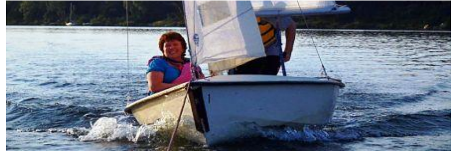
ADULT SAILING CLASSES IN 2012

NOTE: Please arrive or have someone in your group arrive before 6:00 PM to ensure all sailors and paddlers can be seated together.